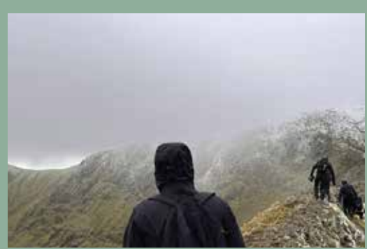
Mike in training before the event