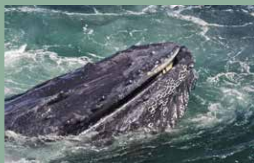
A feeding Humpback whale

volunteer with the Turtle Conservation group.